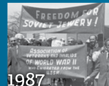
Federation mobilizes 1,700 community members to travel to Washington, D.C. for a march in support of Soviet Jews.