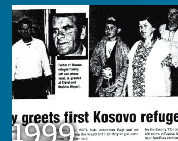
Federation works with Catholic Migration and Refugee Services, the International Services Center and the Albanian community to resettle refugees in Cleveland from the Kosovo crisis; the Endowment Fund approves $25,000 emergency grant for humanitarian assistance to refugees in Albania and Macedonia.

We awoke on Saturday, October 7, 2023 to a living nightmare – the people of Israel were under attack by the terrorist organization Hamas at an unprecedented size and scale. This was no ordinary act of terrorist aggression – this was war. Within days, our community launched an emergency campaign to help provide immediate relief for the victims and their families. Our international partners, American Jewish Joint Distribution Committee (JDC) and the Jewish Agency for Israel (JAFI), were able to bring medical, trauma, and economic relief and recovery to all those in need thanks to the support of Jewish Cleveland.