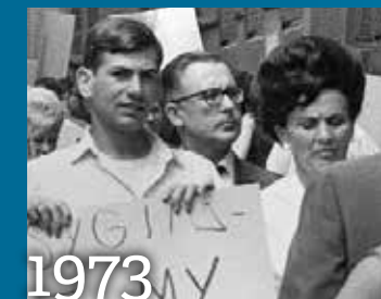
During the Yom Kippur War, Federation raised a record for the highest campaign achievement.