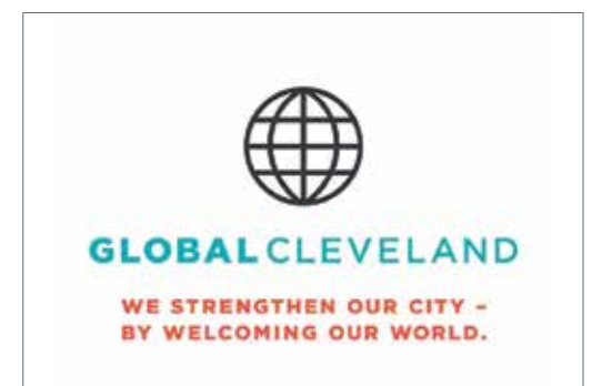
GLOBAL CLEVELAND Charles Eisenman Award